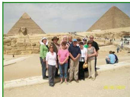
Giza pyramids on Cairo excursion NCL Jade