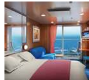
Balcony stateroom $1346

This trip is offered in good faith but remember all rates are subject to availability and change. Cruise rates can not be guaranteed until your vacation is confirmed and your deposit is paid.