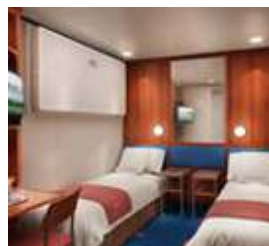
Interior cabin $866