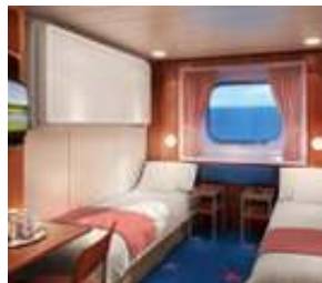
Oceanview cabin $1136